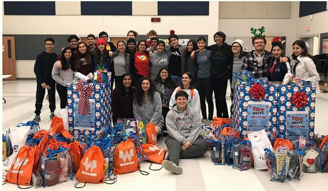
Students and staff from Veterans Memorial High School collected items before the holidays to make goody bags for the CACCB. #EaglePride #EaglesWorkingTogether #KidsHelpingKids #EaglesGivingBack

ROOM MAKEOVER, #WEARBLUEDAY, PRIMARY SERVICES GRAPHIC, UPCOMING EVENTS - 4